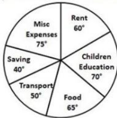
Expenditure on different Heads

The amount spent on Children Education, Transport and Rent is what percentage of the total earnings?